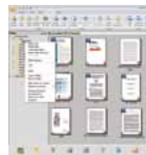
The PaperPort SE14 main screen

- The Professional Choice to Organize and Share Your Documents