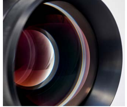
Perfect interplay between high-quality technical components