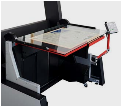
Wide range of interchangeable imaging systems