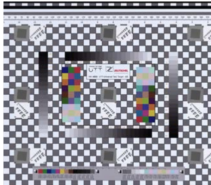
Fulfills ISO 19264-1 Level A, Metamorfoze Full and FADGI 4 Star