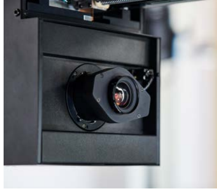
Camera system based on a CMOS sensor