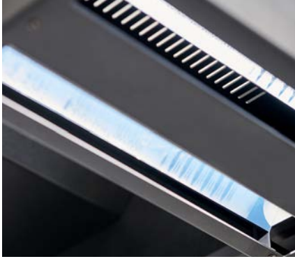
LED lighting system for reflection-free and shadow-free results